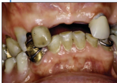
Figure 3: The restored dentition of Mr. J.H. with the interim removal partial denture.

Rational dental care is a framework of decision-making that allows a clinician to develop a plan for the most appro-