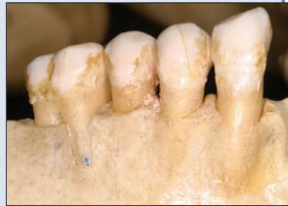
Figure 4: When a dehiscence is present, the buccolingual dimension of the postextraction ridge is likely to pose challenges for future implant placement.