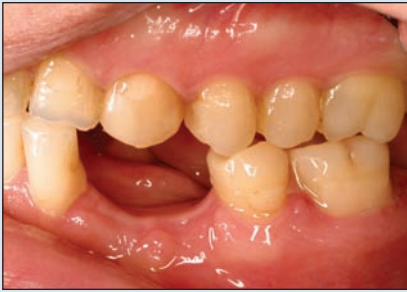
Figure 1: Reduced height of the alveolar ridge following extraction of the lower left canine and first premolar.