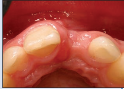
Figure 2: “Collapse” of the buccal socket wall 2 months after extraction of the upper left central incisor. Bone grafting will be necessary if the patient wants an implant.