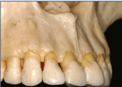
Figure 3: The thin, fragile facial socket wall of the upper anterior teeth is susceptible to damage during extraction maneuvers.