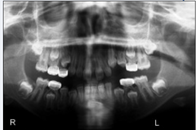
Figure 2: Orthopantomograph shows the remaining deciduous molars with stainless steel crowns and the lower canine in the midline associated with a cystic swelling.