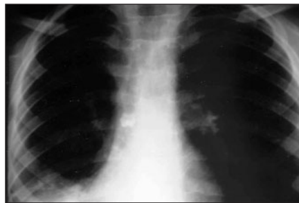
Figure 1: Anteroposterior chest radiograph showing a molar in the bronchus intermedium; atelectasis in the right-middle and lower lobe; and a mediastinal shift to the right.