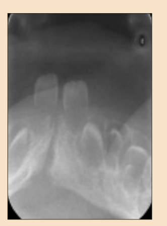
Figure 1: Mandibular anterior occlusal radiograph taken at age 17 days. Neonatal teeth 71 and 81 are present.