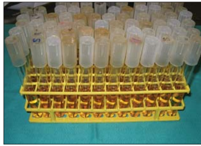
Figure 2: The instruments were placed into test tubes and stored vertically in racks in a 37°C incubator.