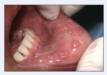
Figure 1: Labial mucosa of a 21-year-old woman shows multiple slightly elevated papulonodular lesions, typical of oral lesions of focal epithelial hyperplasia due to human papillomavirus.