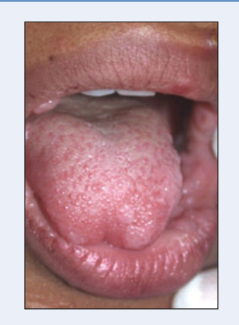
Figure 2: Lesions were also seen on the patient's lip mucosa and tongue.