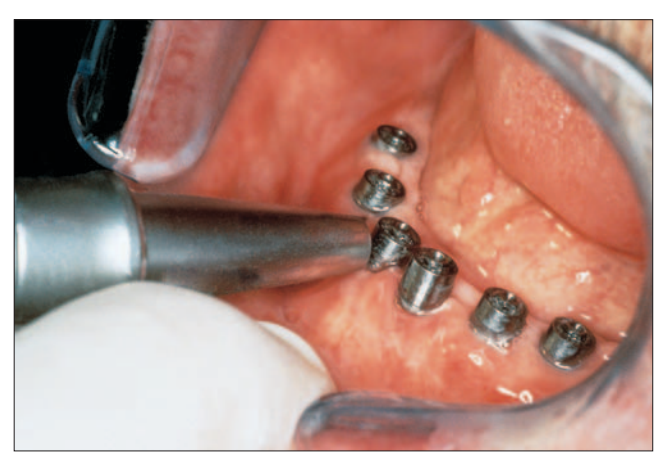
Figure 4b: The Periotest device is used to determine the stability of the implants by measuring their dampening characteristics. Research has shown that the device is of great value in detecting failed or failing osseointegration.

The use of apex locators within endodontic practice is now so ubiquitous that it cannot be considered an emerging technology, but researchers are still investigating ways to improve accuracy, especially under moist conditions. Initial in vitro research suggested that the resolution of apex locators would be \pm 0.5 mm of the apex. However, the results of contemporary in vivo trials are conflicting.<sup>24</sup> There appears to be little difference between the radiographically measured and electronically determined apical position, and the use of such devices cannot guarantee precise determination of the apical constriction.<sup>25</sup> It seems that apex locators should be selected with care. In a recent comparison of 2 common brands of apex locators (both frequency-based), the mean distance from the apex was 0.19 mm for one and 1.03 mm for the other.<sup>26</sup> This study, which employed teeth that were planned for extraction, had an in vivo component and an in vitro histological assessment. A systematic evaluation of the diagnostic performance of some of the tools described in the present series<sup>1–5</sup> would be useful to aid clinical practitioners in their purchasing decisions.