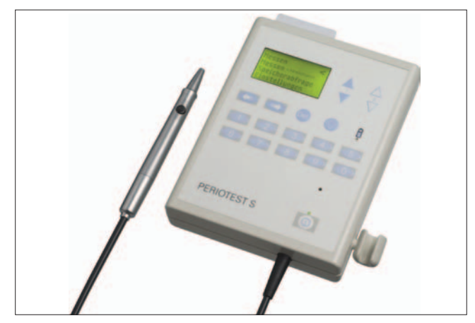
Figure 4a: The Periotest device.

sometime in the distant future (e.g., computed tomography for apical lesions). The following is a brief review of some of the areas in which diagnostic science is advancing.