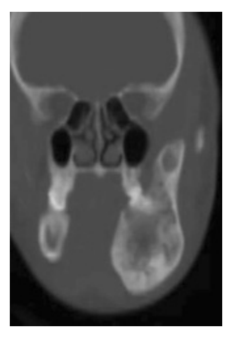
Figure 6: Coronal computed tomography view of the mandible (bone window setting) demonstrating the unaffected right mandible as well as the affected left mandible.

With initial development of fibrous dysplasia the patient usually reports facial swellings and asymmetries. Although the lesion is usually asymptomatic, encroachment on canals and foramina, as well as limitations of movement, may engender complaints of pain and discomfort. In general, males and