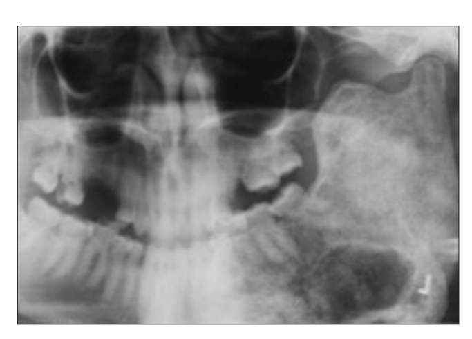
Figure 4: High panoramic view capturing the remodelled neck of the condyle and the coronoid processes of the mandible.

images confirmed the unilocular radiolucency within the bony lesion located posteroinferiorly within the body of the mandible. With the bone window setting, the lesion appeared roughly round with regular borders and no ossified contents. The majority of the central core had a density consistent with soft tissue ( Fig. 5 ). Coronal CT confirmed expansion of the ramus in the mediolateral plane ( Fig. 6 ). The bone morphology of the functional portion of the head of the condyle appeared relatively unaltered. Although biopsy was contemplated, the patient refused any further investigative procedures or treatment for the mandibular lesion. He requested treatment for his presenting complaint only, which was unrelated to the mandibular lesion.