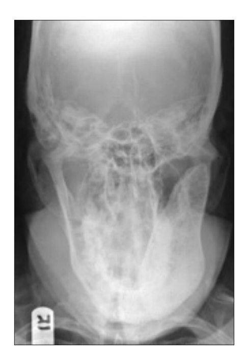
Figure 2: Reverse Towne view demonstrating the extent of the lesion in the buccolingual and inferio-superior dimensions.

The patient was eventually referred to the oral and maxillofacial surgery department at the university hospital for management, where the attending surgeon prescribed a computed tomography (CT) examination. The axial CT