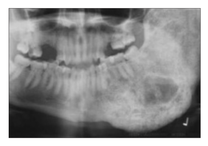
Figure 3: Panoramic view showing the anteroposterior and inferior extent of the lesion. The superiormost extent of the lesion is not visible.

lesion. The posterior mandibular teeth on the affected side were displaced superiorly, and the lesion had evidently altered occlusion. Although the head of the condyle appeared to have relatively normal morphology, the neck of the condyle and the coronoid process were entirely involved by the lesion.