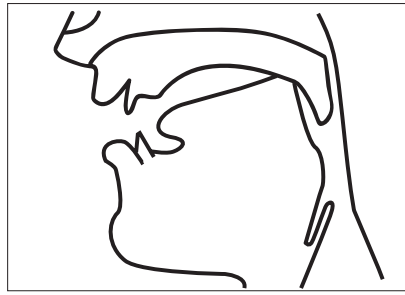
Figure 2a: Midsagittal diagram of the position of the tongue during the production of 'ng'. The dorsum of the tongue is raised posteriorly towards the soft palate. The tip of the tongue is retracted.