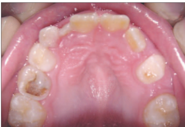
Figure 2a: Upper arch intraoral features at first examination.