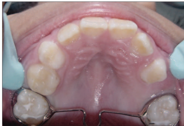
Figure 4a: Upper arch intraoral features at end of treatment.