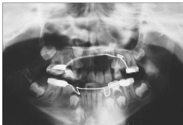
Figure 5: Panoramic radiograph at end of treatment.

correctly, using dentifrice and rinsing the mouth with fluoride. Sealants were applied to the permanent first molars and topical fluoride treatments were provided every 2 months.