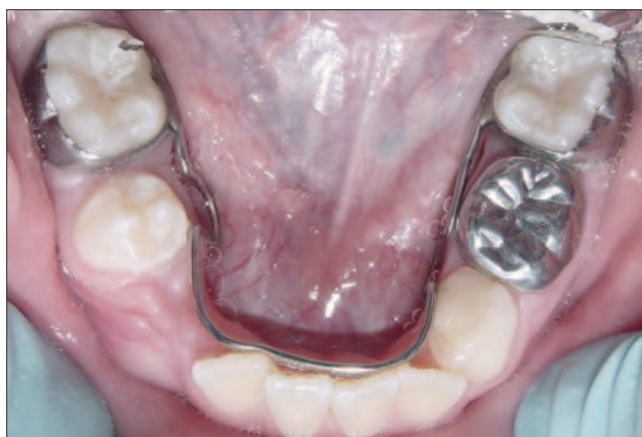
Figure 4b: Lower arch intraoral features at end of treatment.