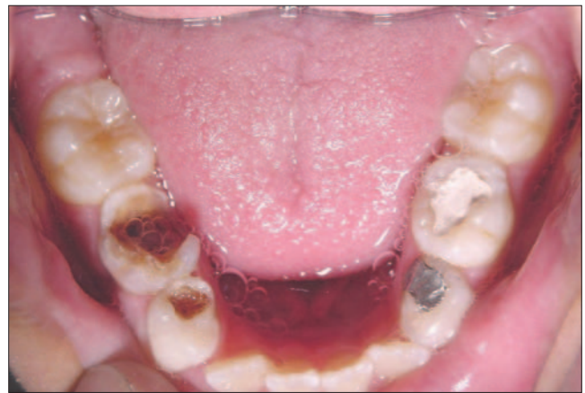
Figure 2b: Lower arch intraoral features at first examination.

lower facial third and facial asymmetry (Figs. 1a and 1b). It also revealed the presence of digital sucking habits.