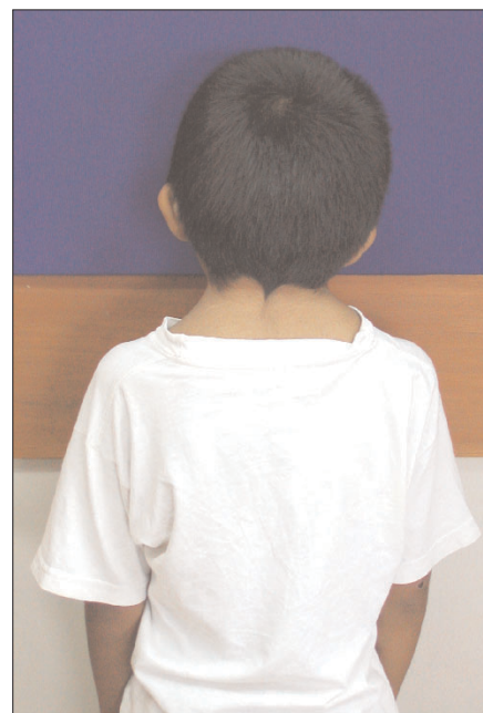
Figure 1b: Clinical photograph showing back view of low neck.