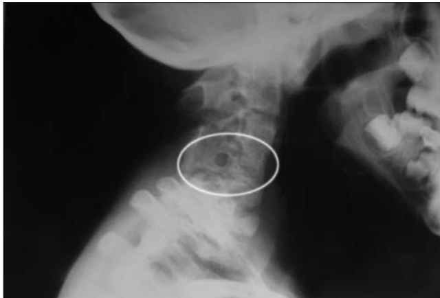
Figure 6: Radiograph showing fusion of cervical vertebrae.

problems can be reduced or avoided when hearing deficiency is recognized at an early age. 13,14