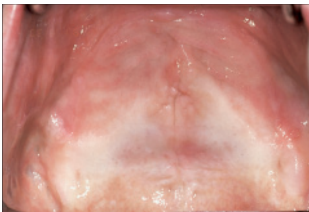
Figure 3: Class IV. No anterior or posterior vestibule.