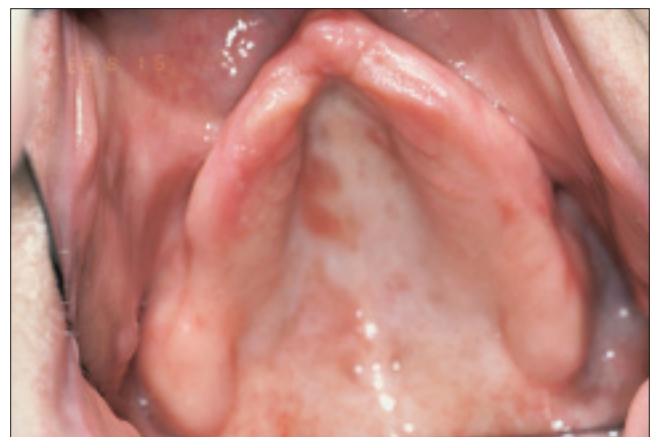
Figure 4: Class IV. Redundant tissue. Major soft-tissue revision required.

Providing complete denture therapy that reflects the needs of individual patients is not a new concept; however, both third-party payers and patients appear to believe that “one fee fits all,” an unreasonable assumption that should be challenged. A formal system of classifying edentulous patients might help in this regard. Determining patients’ treatment needs according to preset criteria may help in setting a reasonable fee for treatment and in identifying patients who are best treated by means of referral to a prosthodontist.