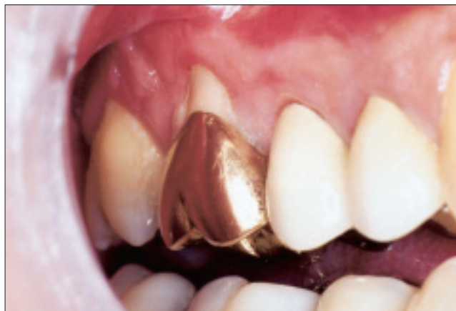
Figure 3: Appearance of the site 12 weeks after graft procedure. A gain in attached gingiva is evident, but root coverage of the mesiobuccal root was unsuccessful.