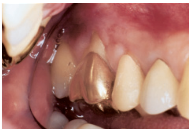
Figure 1a: Preoperative view of the maxillary right first molar of a 45-year-old man shows a deep, wide recession mesiobuccally (3 mm), with inadequate attached gingiva. Distobuccal recession (2 mm) is also evident, but there is no loss of interdental soft tissue.