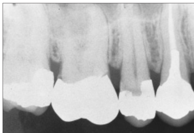
Figure 1b: Preoperative radiographic view. There is no loss of interdental bone.