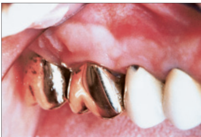
Figure 4a: Treated area 5 years after surgery. Impressive creeping attachment has resulted in complete root coverage.