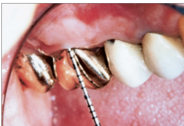
Figure 4b: The gingiva exhibits resistance to probing and probing depth is minimal.