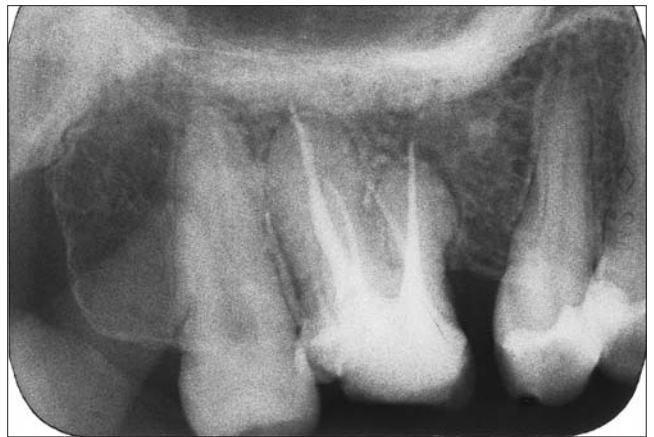
Figure 4a: Postoperative radiograph showing obturation of bilateral 4-rooted maxillary second molar.