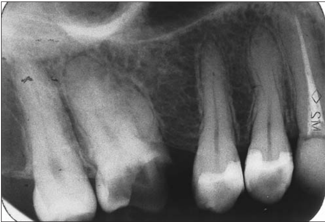
Figure 1: Preoperative radiograph of maxillary right second molar.