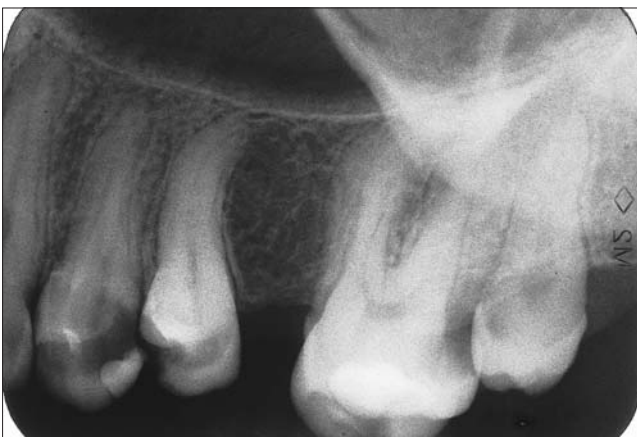
Figure 3: Preoperative radiograph of maxillary left second molar.