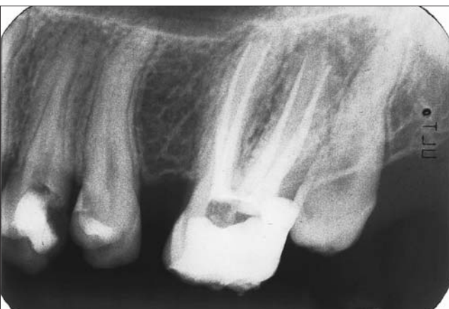
Figure 4b: Postoperative radiograph showing the separation and divergence of the 4-rooted maxillary second molar.

canals were initially instrumented with #15 nickel titanium files (Dentsply Maillefer, Ballaigues, Switzerland) under irrigation with 5% sodium hypochlorite (NaOCl), then dried with sterile paper points. Calcium hydroxide paste (Produits Dentaires S.A., Vevey, Switzerland) was used as an intracanal medicament. A sterile cotton pellet was placed in the pulp