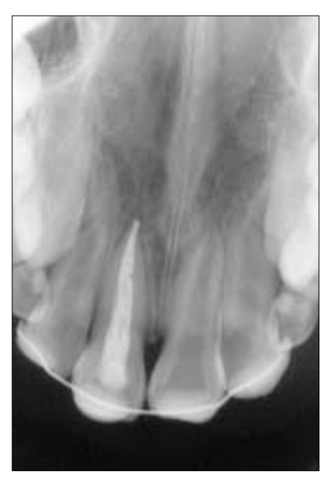
Figure 1: Maxillary occlusal radiograph taken immediately after replantation shows proper repositioning of avulsed tooth 11.