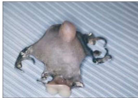
Fig. 3b: Obturator removed.