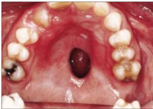
Fig. 3a: Nasopalatal defect.