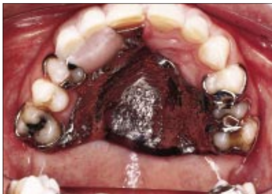
Fig. 3c: Obturator inserted.

thetic tone is responsible for the vasoconstrictive, tachycardiac, and dysrhythmic actions of the drug. 6,8,14,16,17